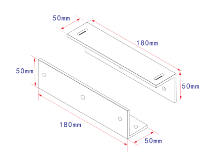
Magnetic Lock Z-Bracket (280KG)